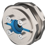
C RS T kit

For detailed information, please visit roxtec.com .